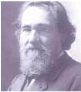
Ilya Mechnikov 1908 Nobel Laureate

A lmost 100 years ago, the Russian born bacteriologist and 1908 Nobel Laureate, Ilya Mechnikov, stated: "Death begins in the colon."